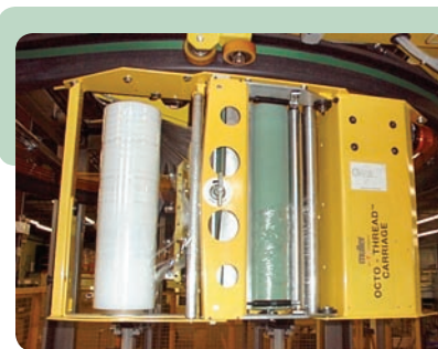
Octo-Thread film carriage

With its rear opening film loading gate, the Octo-Thread film carriage allows for fast, easy and safe film threading. The standard tilting film mandrel allows the operator to load a film roll with greater ease. It also reduces the risk of damaging the film roll during loading.